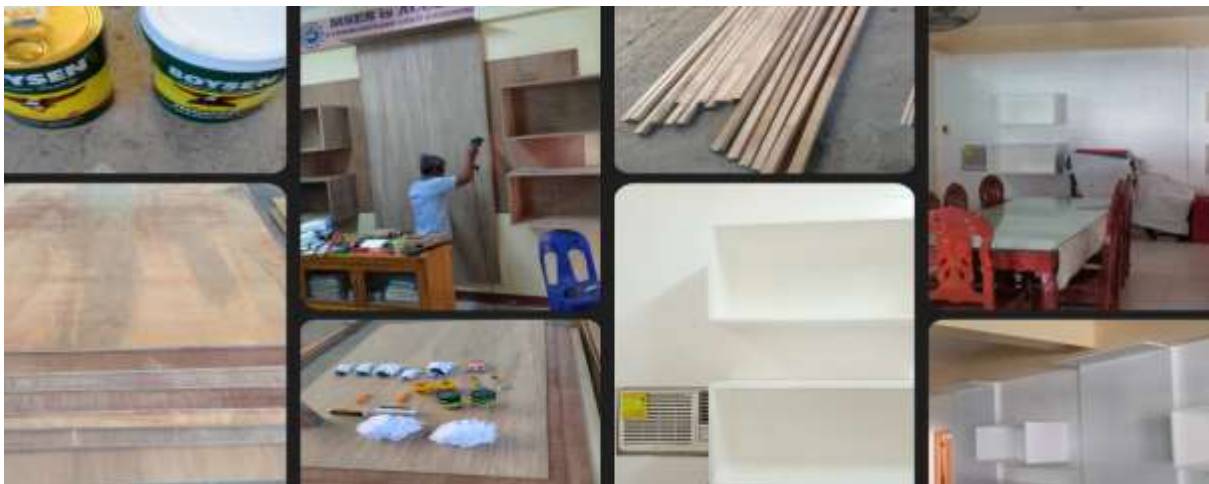
Materials in repairing and maintenance on school facilities and buildings.