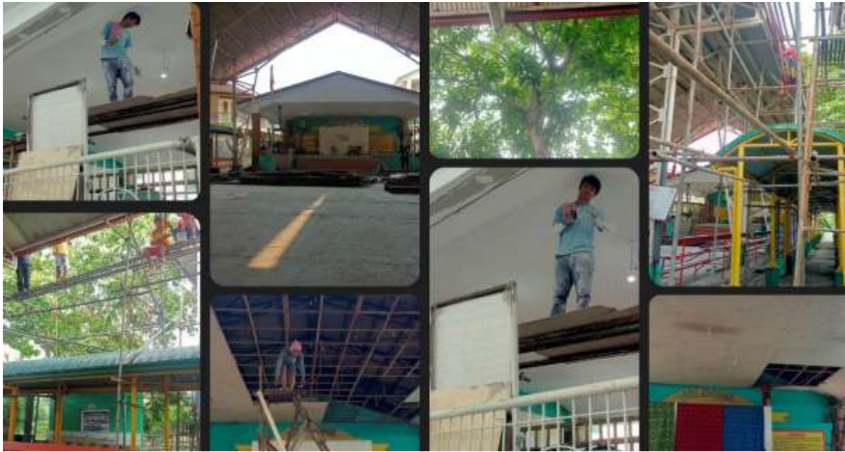
School repairs and maintenance