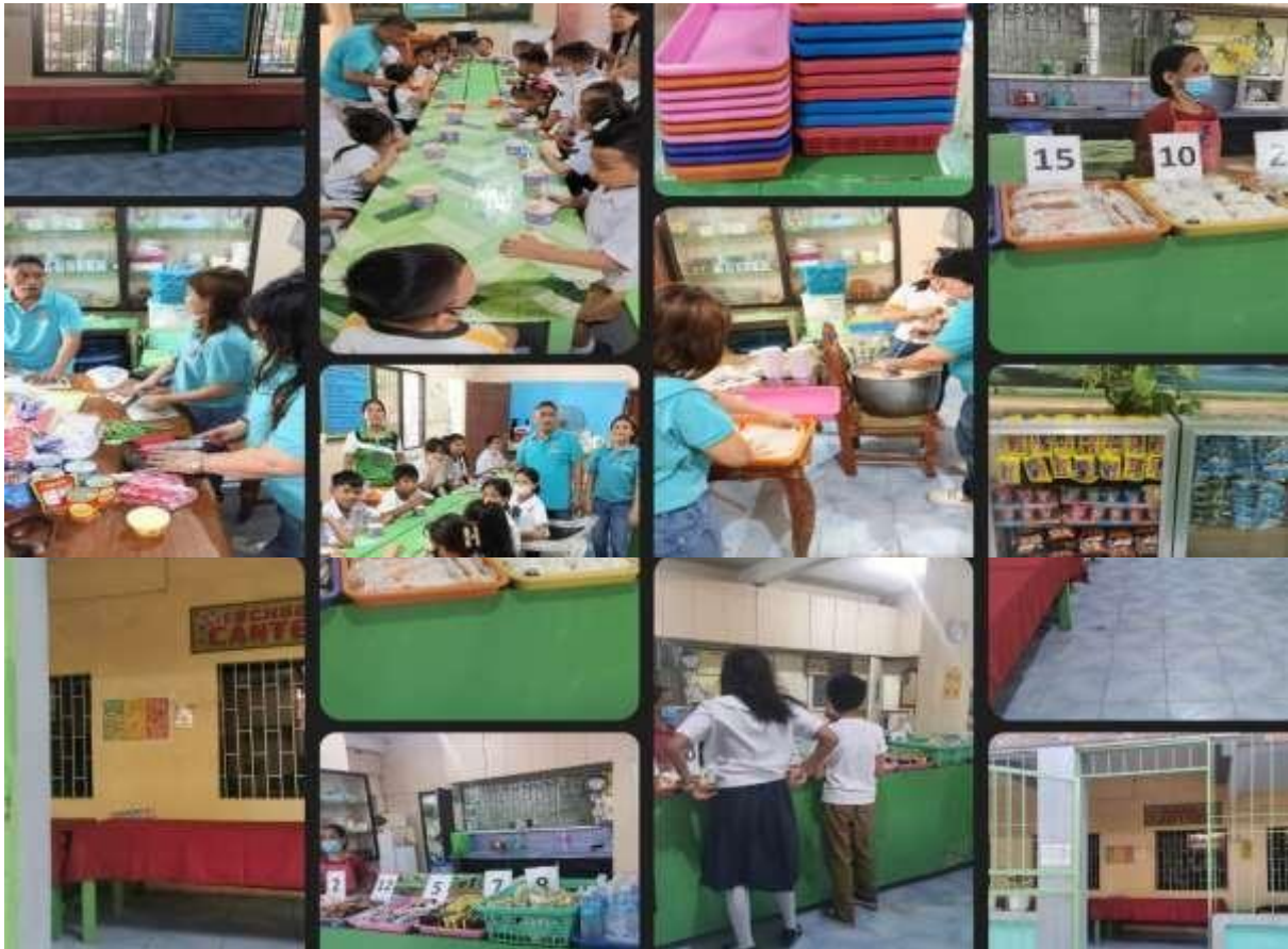
The outside and inside view of our school canteen.