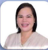
Vice-Chairperson/ Guidance Coordinator