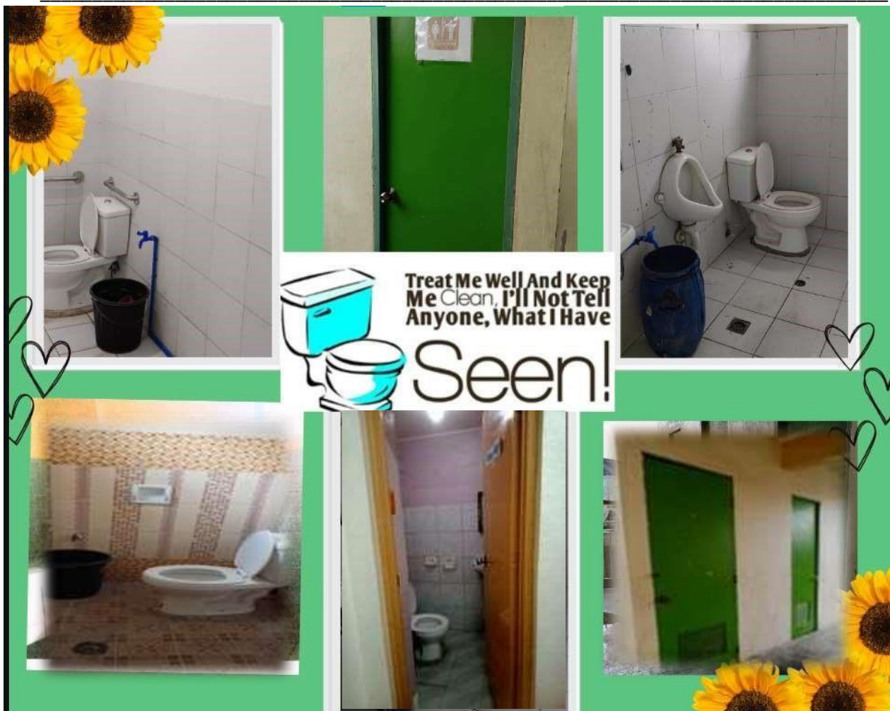
MSES' comfort rooms are functional, clean, and comfortable for the pupils and staff.