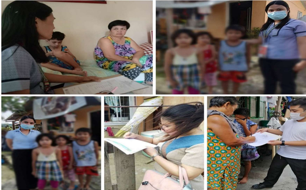
A strong implementation of mandatory immediate home visitation by the respective class advisers to their learners with class attendance problem