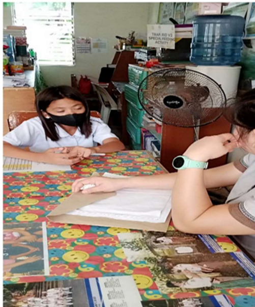
Counselling with one of the PARDOs