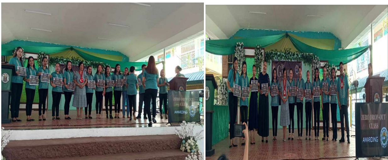
Teachers' recognition on Zero Dropout Class during 1 st Gawad South Lakes