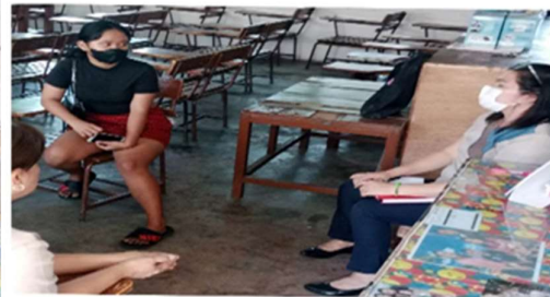
Some scenarios during a conference with the parents, PARDOs and the class adviser